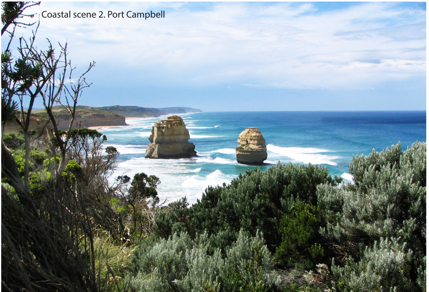
Coastal scene 2. Port Campbell

Scene 2. Maybe less foliage at bottom right, show more sea and waves? It's up to you. You are the artist. The photo can be changed.