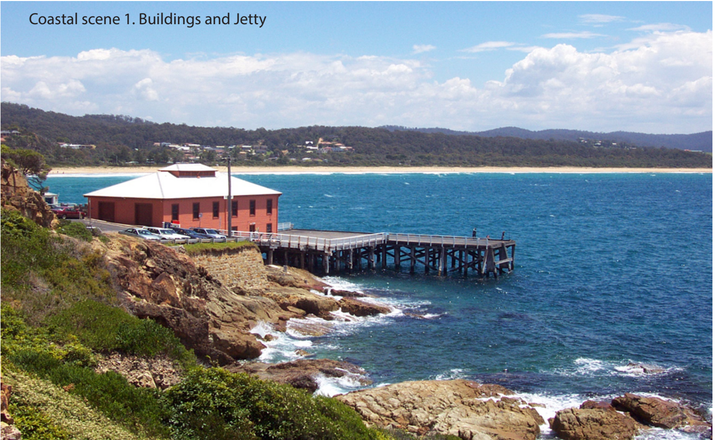
Coastal scene 1. Buildings and Jetty

TIP Strive to capture the feeling and essence of the scene